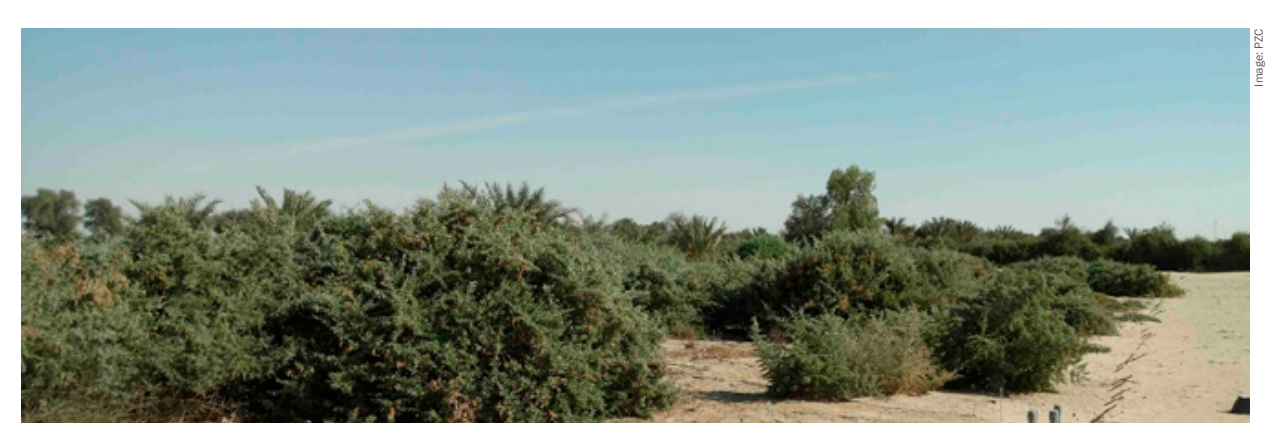
Greening the Earth plantations trialled at Gayathi in western Abu Dhabi on land owned by the UAE Environmental Agency to test maximum moisture capabilities necessary for positive plant establishment purposes. Saltbush and local companionship species were successfully grown from encased seed pellets and irrigated using saline ground water for five minutes overnight

Most importantly, a solution requires the ability to foresee and appreciate events over the long term, the development and maintenance of a narrative for change that can inspire the range of stakeholders required for the period of time needed to achieve sustained, beneficial change. This change requires local leaders to be mobilized in each area, the action of key opinion and policymakers and leaders at both national and international levels, and appropriate partnerships across many levels.<sup>11</sup>