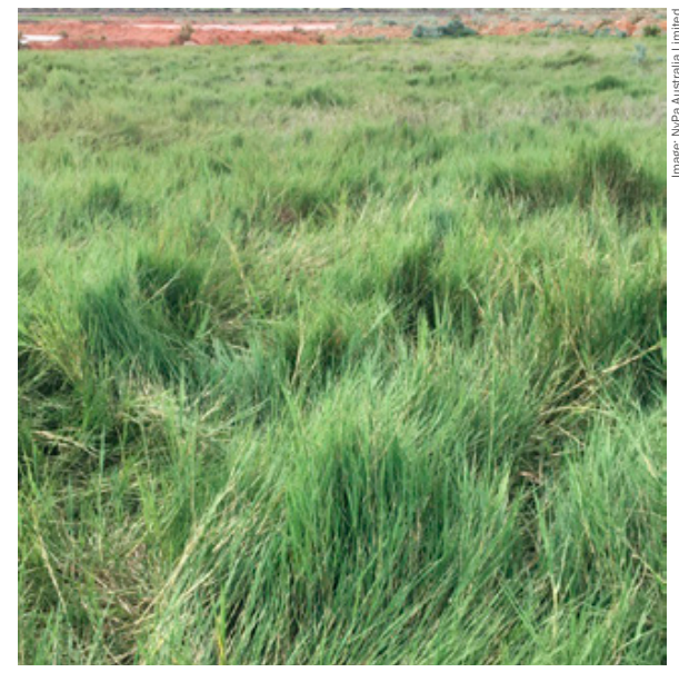
Commercial application of halophyte Distichlis spicate Var. 4a (NyPa Forage<sup>™</sup>) growing on saline aquaculture effluent in the central wheat belt of Western Australia. This sets an example for the valuable use of a resource common in many degraded areas of the world