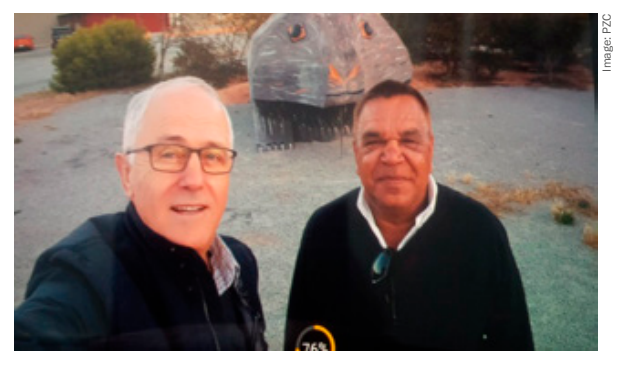
Prime Minister of Australia, Hon. Malcolm Turnbull MP and Scotdesco CEO, Robert Larking, discuss the progress of the Scotdesco project, October 2017